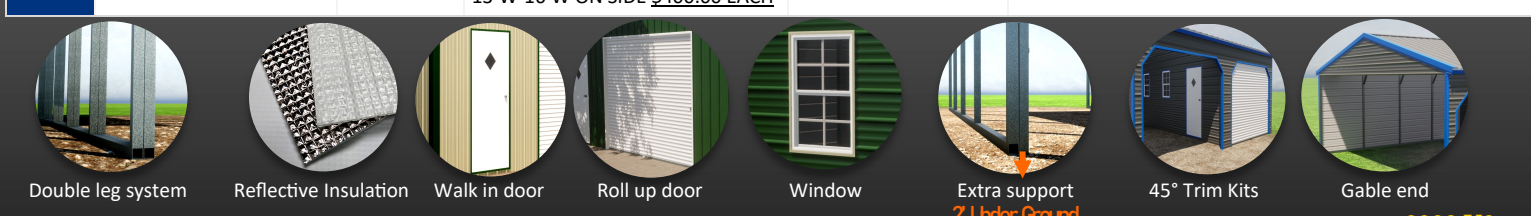
Double leg system