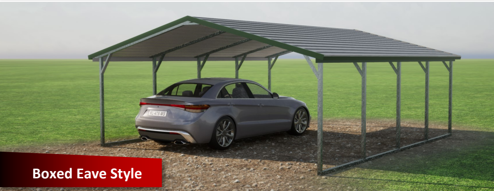
Boxed Eave Style