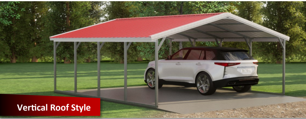
Vertical Roof Style