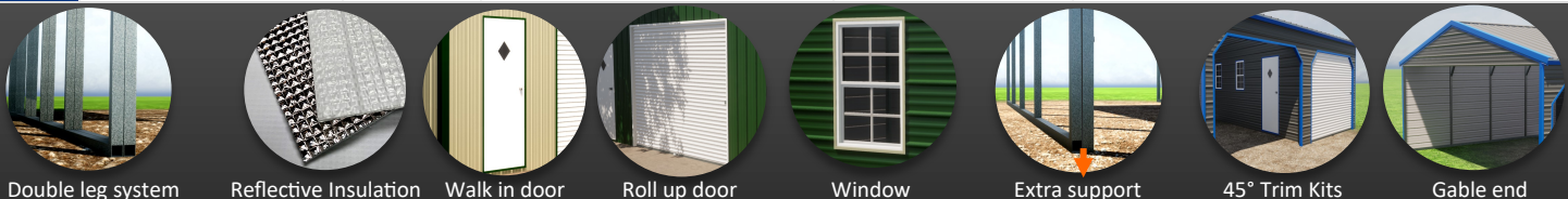
Double leg system Reflective Insulation Walk in door Roll up door Window Extra support 45° Trim Kits Gable end 2' Under Ground