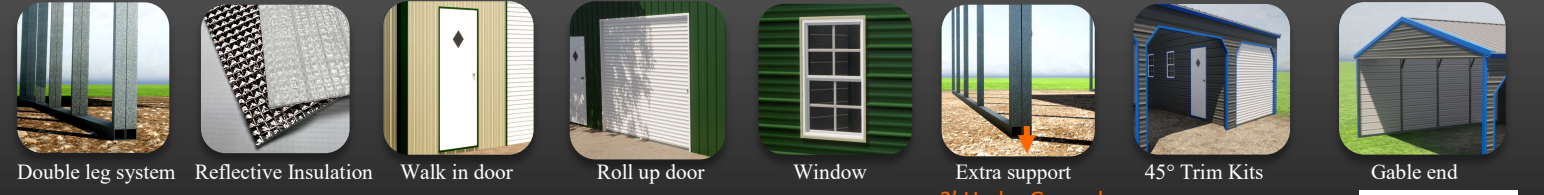
Double leg system Reflective Insulation Walk in door Roll up door Window Extra support 45° Trim Kits Gable end