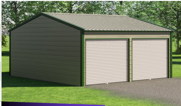
Vertical Roof Style

VERTICAL ROOF HAS NO OVERHANG ON FRONT OR BACK JUST ON SIDE EAVES.