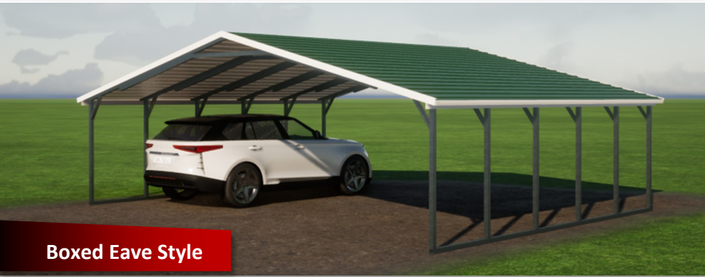
Boxed Eave Style