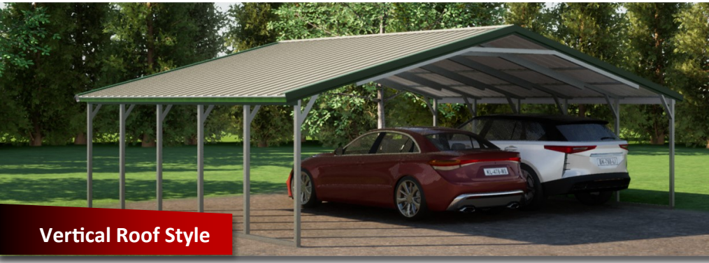
Vertical Roof Style